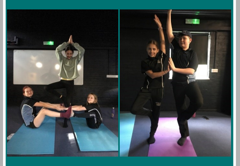
KS4 Yoga continues on Fridays, open to all Year 10 and 11 students. With PPEs approaching, the focus for this half term will be de-stressing and being playful.

KS3 Yoga is taking a break next half term, due to Year 11 PPE preparation. It will return again in the New Year. Here are a few photos from our last session.