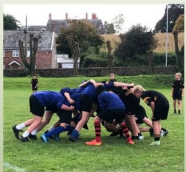
Year 8 Rugby Heathfield 4 Tries - Court Fields 4 Tries A good performance from our year 8 Rugby team, bouncing back from last week's result to draw against a very good Heathfield side.