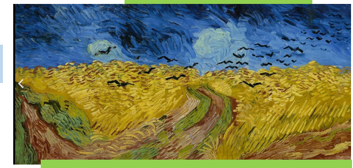
Wheat Field with Crows 1890