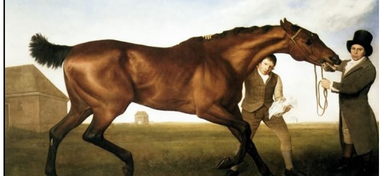
Hambletonian, Rubbing Down (1800)