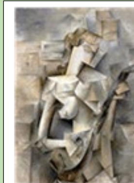
Pablo Picasso -Girl With a Mandolin 1910

He was inspired by artists working just a few years before him and at the same time who had broken away from traditional forms of art: