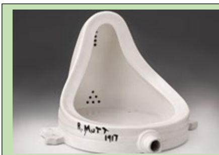
Marcel Duchamp – known for his 'ready mades'