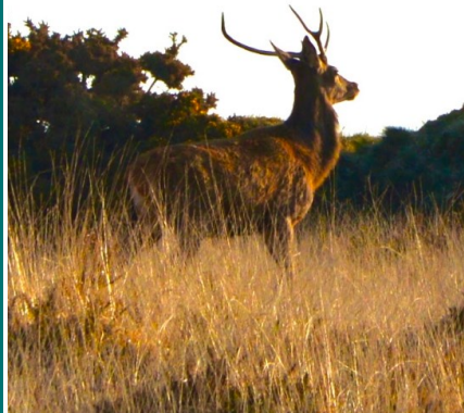
Thomas H 'Morning Stag'

Beautiful autumn colours. How wonderful to have been so close!