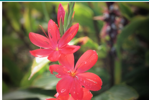
Summer B 'Lovely Red Flower'

This cheery South African flower is one of the latest in the garden. It is reasonably sharp and the background not intrusive.