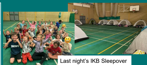
Last night's IKB Sleepover